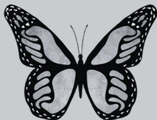
Mariposas Symbol of Migration

Opening Reception: February 6th 11:30AM-1:30PM Remarks at 12:00PM Refreshments provided